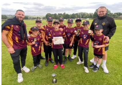
The Under 11's team

The Junior Presentation night took place in a packed clubhouse on 13th September and there was much to celebrate, including a personalised video message of congratulations to the club's juniors from England star Matthew Potts. The U9s have finished 7th in